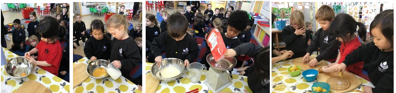
To mark Shrove Tuesday, our Reception children made pancakes – yummy!

At the start of Lent, let's take time to reflect, think of others, and prepare for the Easter period.