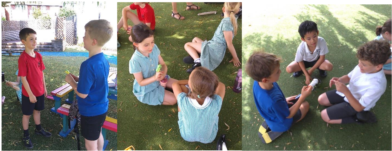
Year 3 practised their role play and social skills (reviewing greetings / asking for things/ being polite to one another) in French this week.