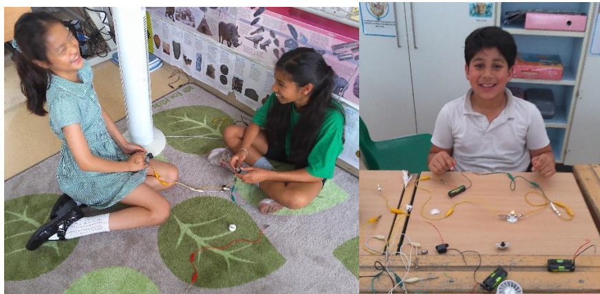
In Science this week, Year 4 had a great time building electrical circuits. They were very pleased when they worked!