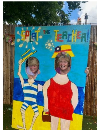
Some 'willing' volunteers getting very wet for a good cause!