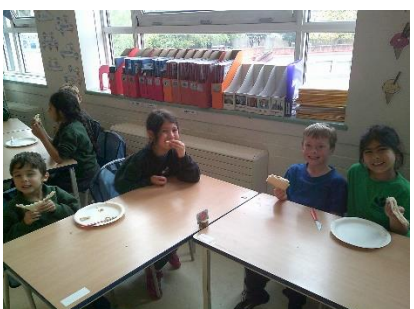
Year 2 made jam sandwiches today for no writing day, linked to their instruction writing unit.