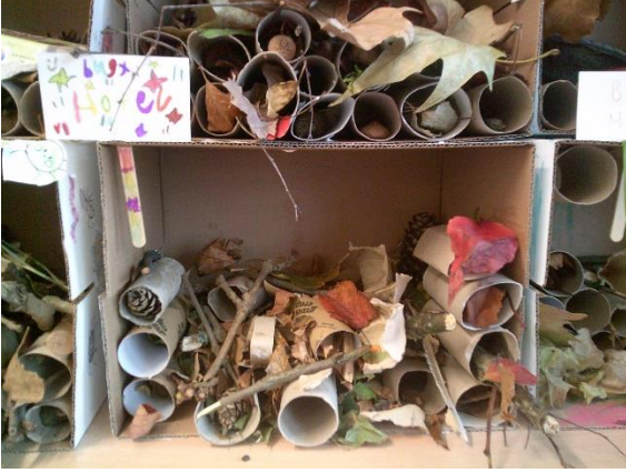
Year 2 made Bug Hotels this week in Science, as they learnt about microhabitats.