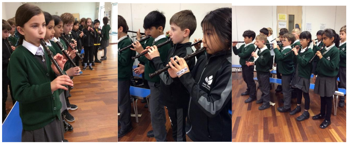
Year 4 did a super recorder performance for a year 2 & 3 class and did an amazing job at performing all the pieces they had learnt to play this term.