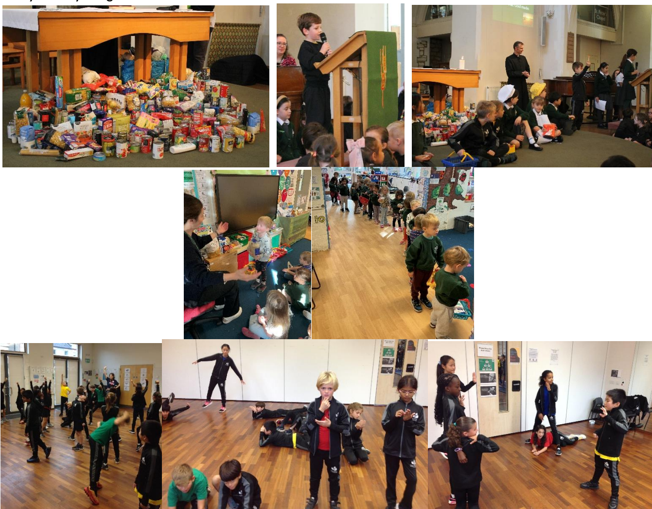
The whole school participated in workshops this week to celebrate Black History.

Thank you for your generous donations of items which will be delivered to the Wimbledon foodbank.