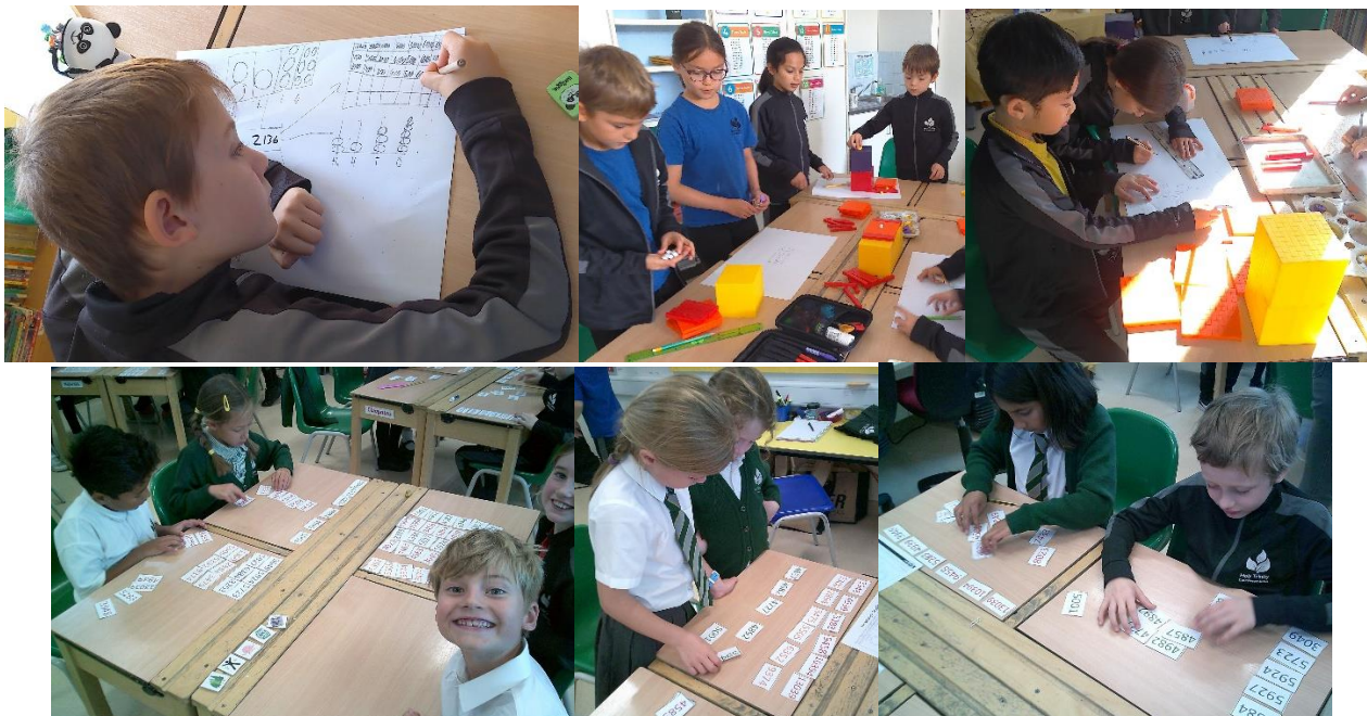
Year 4 having been learning about place value up to 10,000 and ordering numbers. Great work Year 4!